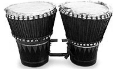
Modern Bongos and African Bongos