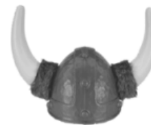
Edvard Grieg (1843-1907) Norway