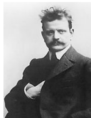
Edvard Grieg (1843-1907) Norway