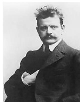
Jean Sibelius (1865-1957) Finland