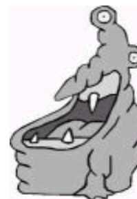
A Monster of Harmony!