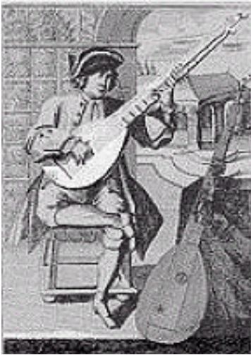
the BIG Theorbo

REMEMBER: There are many different instruments in the guitar family.