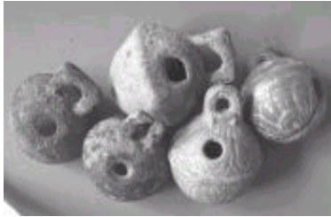
crotals or jingle bells

REMEMBER: Bells of all shapes and sizes are very important to Asian cultures.