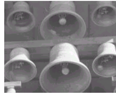
cast bells in a carillon