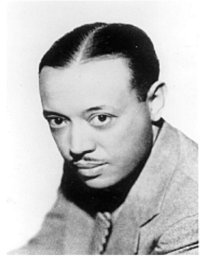
William Grant Still 1895-1978

JOLLIP WANTS YOU TO REMEMBER THAT DISCRIMINATION IS A BAD THING!