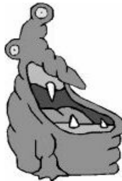
Jollip the Music Monster