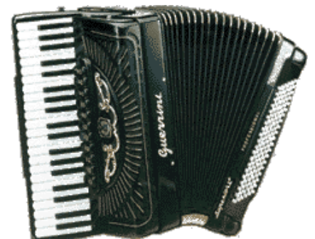
What is this instrument?

Ensemble search: band quintet choir sextet duet septet orchestra solo quartet trio